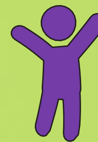
Intellectual + Developmental Disability Services