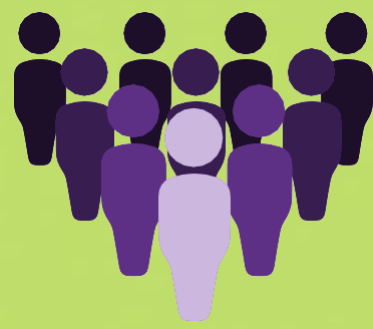
Substance Use/ Recovery