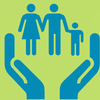
Child + Family